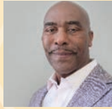
MAYOR Wayne Codner