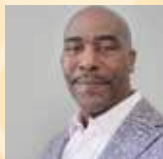
MAYOR Wayne Codner